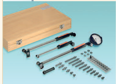
SUBITO® several complete sets