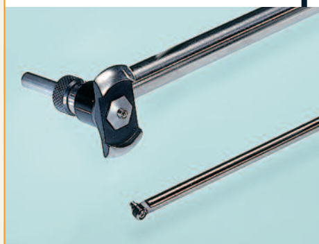
SUBITO® SU 4,5 - 6 and SU 35 - 60