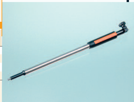
Measuring depth extension MTV

Inspection Certificates for SCHWENK measuring instruments see p.32